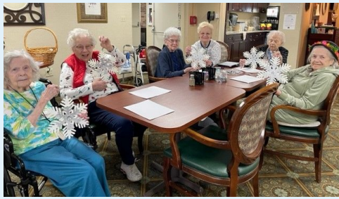
Residents enjoyed making a large snowflake to hang on their door.