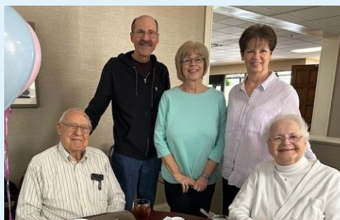
The Lambs celebrated their 73rd wedding anniversary. Congratulations!