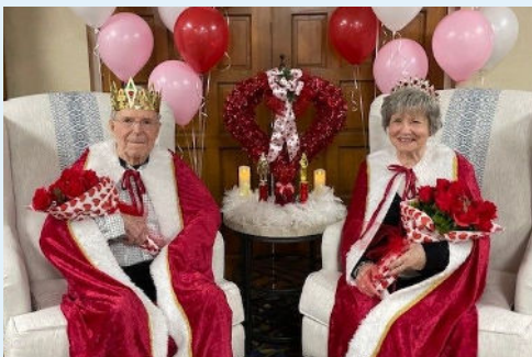
2024 KING & QUEEN

Some see dandelions as unwelcome weeds, but this plant with its familiar bright yellow flower has many culinary uses. Its head, root and leaves are used in teas, soups, salads and jelly.