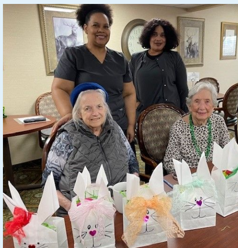
Easter Bunny Bag Craft

Q: I have wings; I have a tail; across the sky I will sail. I have no eyes, ears or mouth, & I bob randomly from north to south. What am I? A: A kite.