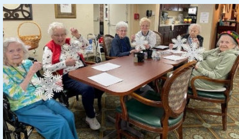
Residents enjoyed making a large snowflake to hang on their door.