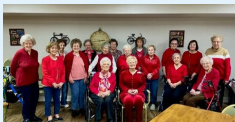
Our ladies in Red