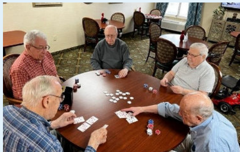
Men's Poker Game started back up!