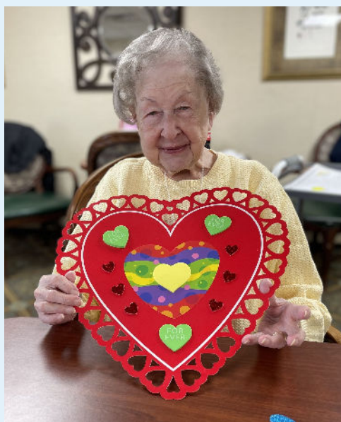
Residents' creations of love