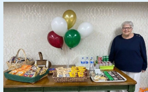
Super Bowl Party was a big hit!!