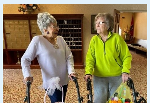
How many eggs did you get? Pictured right column top to bottom: 1st Baptist Church Ice Cream Social / Baskin-Robbins. Easter Bonnet Fashion Show participants with Angel, our pet friendly Ambassador.