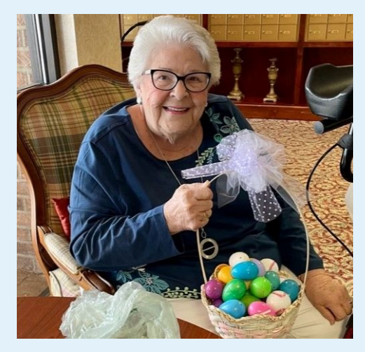
I need another basket please!