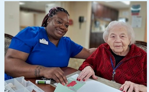
Making Christmas Cards.